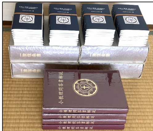
May Conference Supplies

documenting the chronology of our past LCMS career missionaries in Japan, has finally borne fruit. It traces the continuous LCMS missionary presence in Japan—since its 1948 beginning to the present—of 79 LCMS missionary family units, surging to an all-time high in 1964 of 40 LCMS missionary units serving at the same time in Japan. What a cloud of witnesses to cheer on your current individual missionary unit here! ♦