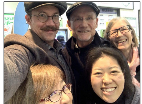
Numata, Gunma Prefecture

Whether far south in Kyushu or somewhat north in Gunma, we LCMS missionaries in far parts deliver life and salvation through pastoral visitation.